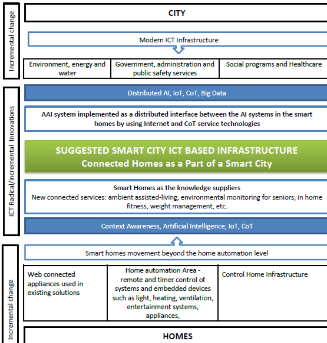
Fig. 2 Innovative Smart City based infrastructure – Connected homes as a part of a Smart City

The innovation process in a smart city and smart home can be also seen from the perspective of Schumpeter innovation theory as the succession of invention, innovation and diffusion. Looking at the smart city and smart home needs, the concept of services has increasingly become important to many fields, including environment, energy and water, government, administration and public safety, social programs and healthcare. In this context CoT, IoT, AAI in a smart city context provides personalized health care, intelligent community services, and green ecosystems among other things.