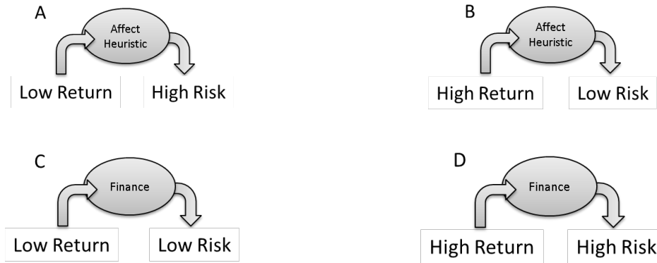
Figure 1. Schematic Overview of the Affect Heuristic Model. This figure presents a schematic overview of different predictions made by standard finance and the affect heuristic, respectively. Panel A and B show how positive (negative) affect caused by low (high) return increases (decreases) perception of risk. Panel C and D represent the inferences made in standard finance based on equilibrium models such as the capital asset pricing model (CAPM). This figure shows that the two predict exactly the opposite effect on risk (perception).