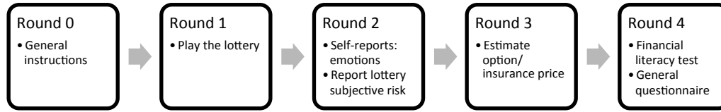
Figure 3. Schematic Overview of the Experiment. The figure shows an overview of the sequence of events in the experiment. In round 0, subjects were allowed to read the general instructions conveying information regarding the procedures during the experiment and payment. In the first round subjects selected their lottery ticket, which determines whether they won or lost the lottery. In round 2 subjects had to report information regarding their emotional state and provide a risk assessment of the lottery. Round 3 consists of the option pricing task, while round 4 consists of a financial literacy test and some additional questions regarding the individual's investment style.