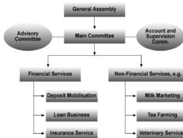
Figure 2: Service Delivery Structure

Apart from these committees, which you can find in any SFCL, there seems to be much flexibility in regard to the creation of additional committees and sub-committees. Among these can be an Advisory Committee, composed of renowned people from the respective VDCs, like the Branch Manager of the ADBN and former Vice-Chairperson of the VDC, as in the case of SFCL Kumroj. This Advisory Committee is invited to MC-meetings. Figure 2 summarises the typical service delivery structure of SFCLs.