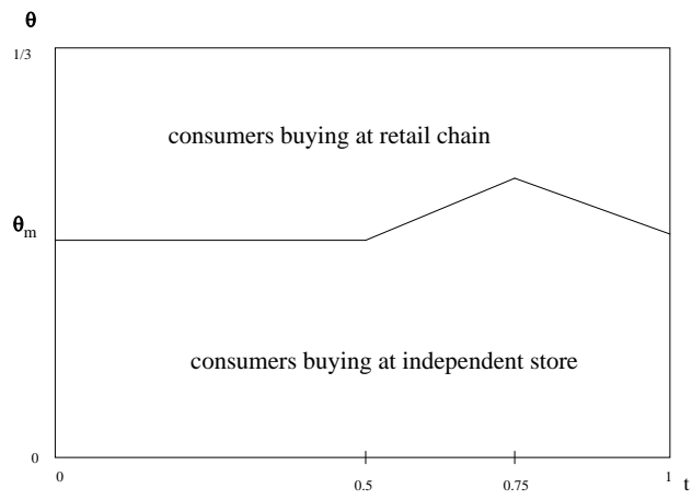
Figure 2: Case 3