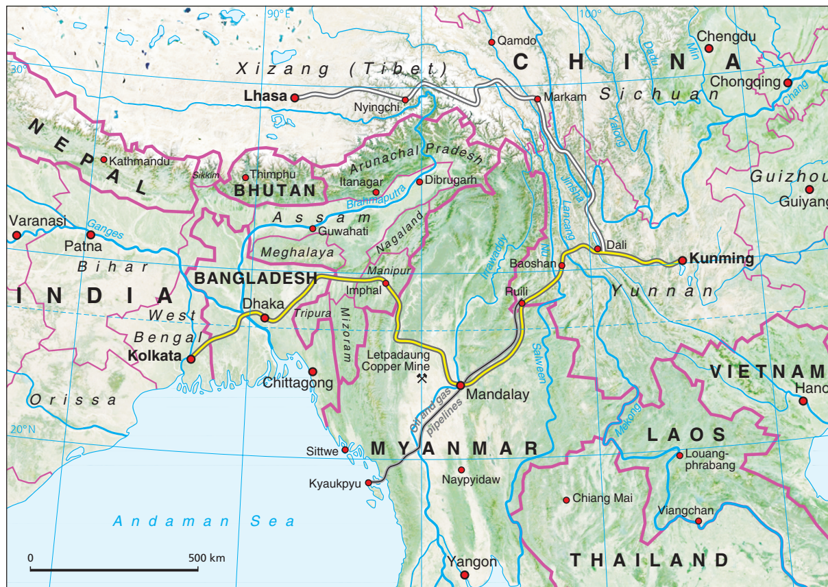
Figure 1: Borderlands between Northeast India, Bangladesh, Myanmar and Southwest China and planned road connection Kolkata (West Bengal)–Kunming (Yunnan)