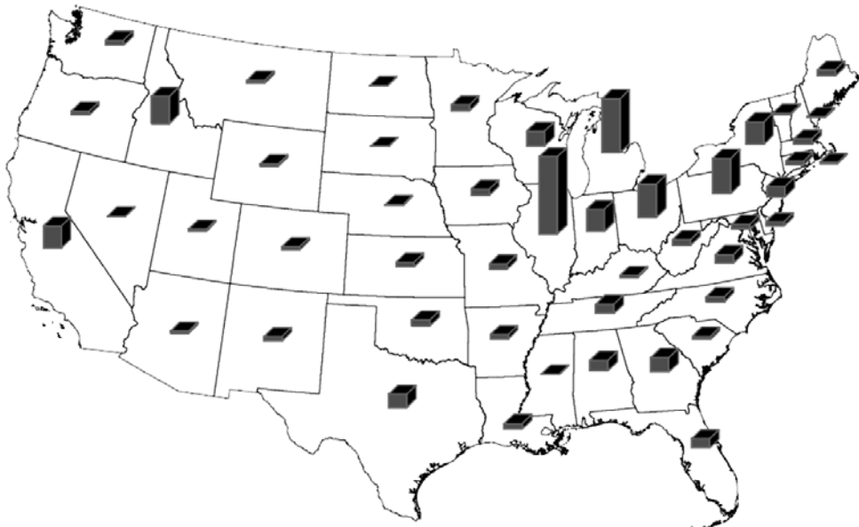
Map 2: U.S. Inter-State Trade by State of Origin, 2007