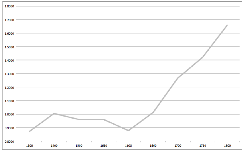
Figure 1: Urban over agricultural unskilled workers' wage ratio in Southern England (London is excluded).