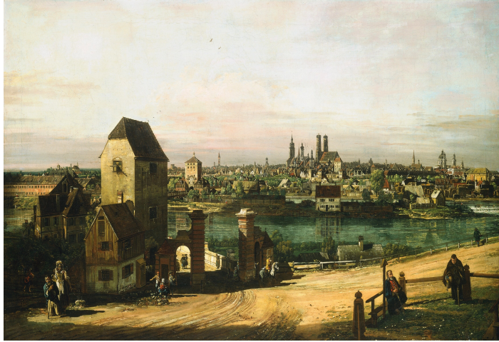
Figure 1: Munich in a 1761 painting by Canaletto

good reason. A young city’s policy is unlikely to be informed by its shape. But for any mature city this seems more difficult to justify. Surely policy adapts much quicker to its surrounding physical structures than these structures do to policy? Once the city has developed its shape – subject not just to early policy but also to numerous other forces of history (e.g. hinterland safety, political institutions, past zoning) and geography (e.g. topography and soil texture) – policy should (also) be expected to follow shape.