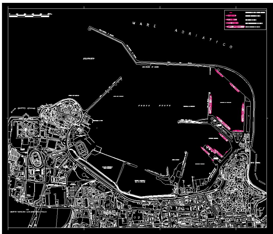
Figure 1 – the port of Bari

Being the seaport of Bari an urban seaport , it is hard to find available areas for a physical expansion of the seaport from the existing location. This is a strong limitation to the growth in capacity of the seaport, since it does not allow any enlargement of the areas outside the current borders of the port. Moreover, it creates several limitations to the conjunction of the seaport infrastructures to the road and railway network, since the necessary links should cross built areas with high density of population.