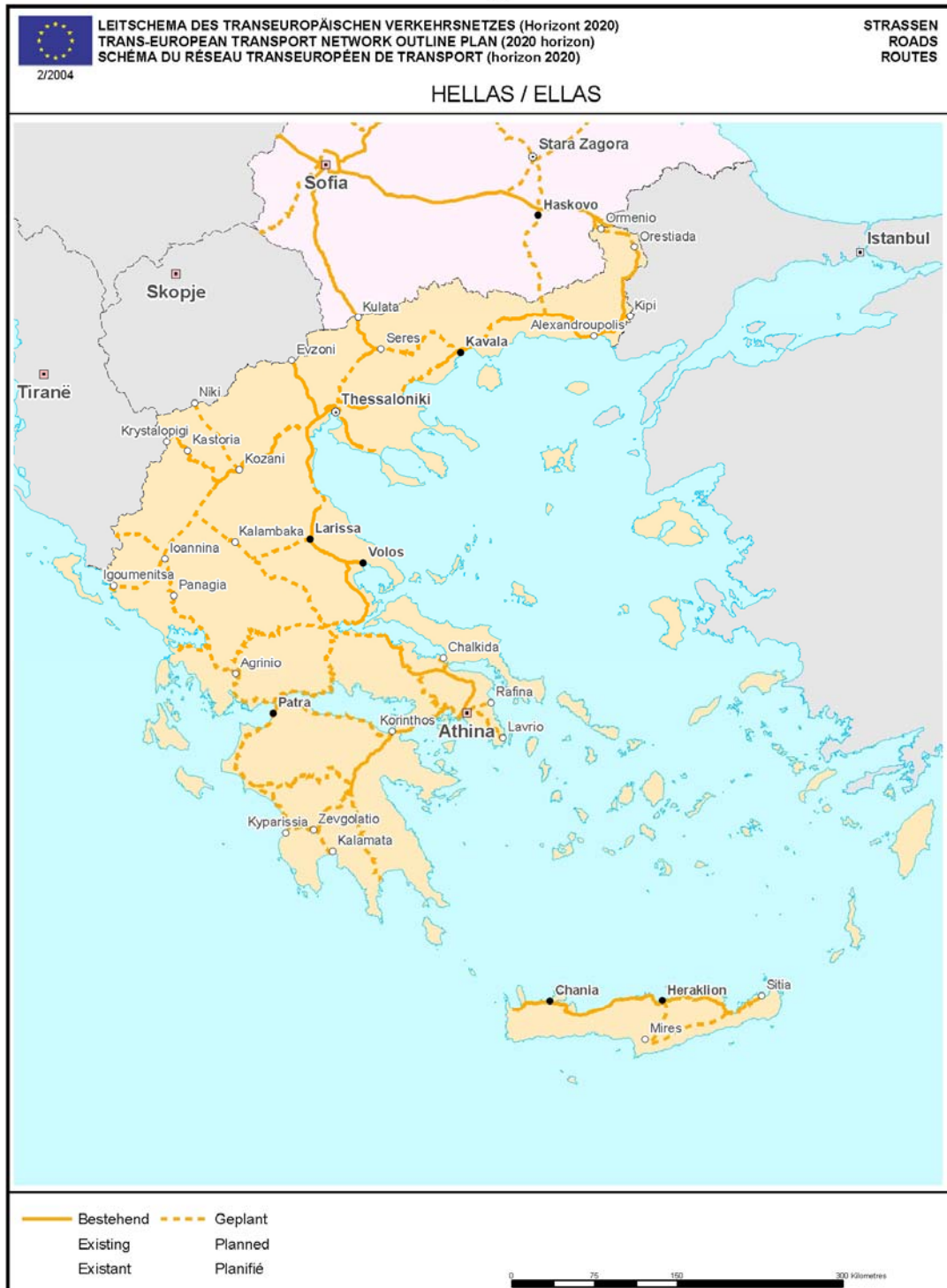
Fig. 1: The TEN-T (Trans European Transportation Network) in Greece (only roads shown).