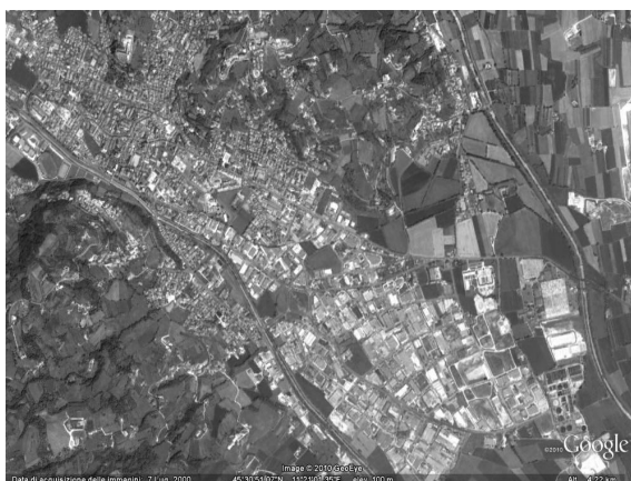
Fig. 5. Arzignano in Veneto Region, is the most important leather tanning Italian industrial district: in 2007 the municipality made the 0,1% of GDP. The high pollution dued to the leather work process has transformed the production cycle in a more sustainable way.