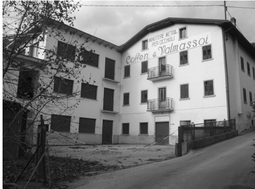
Fig. 11 The shrinkage of historical industrial district of glasses in Veneto Region (Cadore).