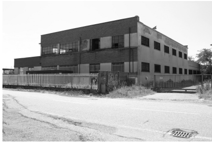
Fig. 9, 10 Old and new vacant productive buildings (textile and food enterprises) in North West Milanese urban region.