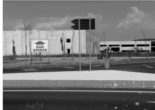
Fig. 13, 14 Widespread warehouses in whichever Italian industrial district.

According to Viganò (2001) an innovative landscape and environmental policy cannot be restricted to the protection and conservation of a certain number of contexts with particular aesthetic and natural prestige. It is my contention that it could be aimed to much more ambitious objectives. The porous characters of the “diffused” city (or urban sprawl) presents, in any case, play a critical role to emphasize the development of biodiversity and expansion of natural habitat.