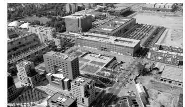
Fig. 15, 16, 17 Milan, Bicocca area around 1920 (with Pirelli and Breda industrial buildings), 1980, and today (one's of Europe most innovative academic/industrial district).