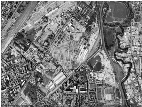
Fig. 1. Sesto San Giovanni. The brownfield of a huge steel industry in North Milan (Falck area).