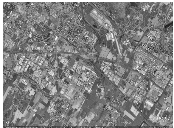
Fig. 4. Prato. The invisible transformation of an historical textile district of Tuscan SME in a network of international Chinese clothing enterprises.