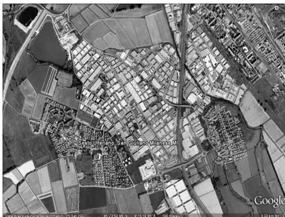
Fig. 3. San Giuliano Milanese. An old small and medium enterprises area in traditional sector transformed in a big logistic platform inside the boundaries of a rural park in the South East of Milan.