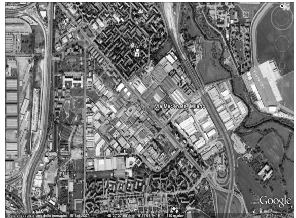
Fig. 2. Via Mecenate, Milan. A dense mixité of small firms, vacant buildings, commercial, logistic settlements, and residential units inside the compact city.