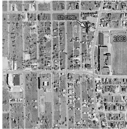
Fig.7, 8 Detroit, before and after the decline of the car industry.

In Italy the situation is quite different. We are in front of a different typology of shrinkage: the decline of the typical Italian SME's industrial districts. Features characterizing Italian districts are articulated in several exhaustive studies (e.g. Piore Sabel 1984; Sforzi 1989; Garofoli, Scott 2007) Italian industrial districts are often the result of resilient cultures, organized politically on the basis of long standing communities. Italian industrial districts are now under the pressure of the international crisis, but also their problems stem from the results of their own decisions such as delocalization. low investment in education and skills, human capital and innovation technology. Despite intensive research, the patterns and the landscape of productive settlements remain poorly understood.