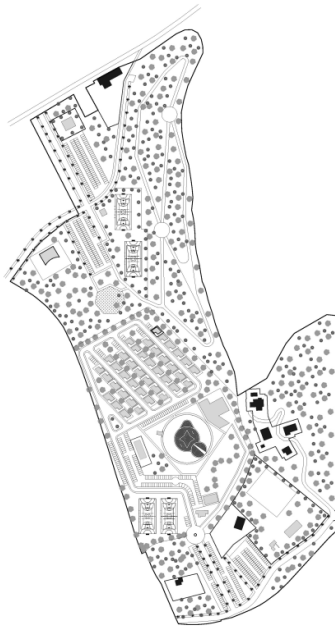
Figure 5. A sketch of Plan 4 (Elaborated by Sulis, cit. in footnote 6)