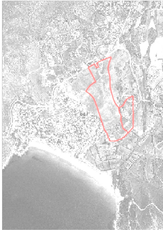
Figure 1. Delimitation of the area for the planning proposals. The area is located in a tourist coastal zone of the actual Masterplan of Sinnai. The area is classified as “F4” (the largest share bounded by the red line) and “F2” in the MPS

After the adjustment of the MPS to the RLP the tourist coastal zones could not maintain their status, thus building new houses and hotels would not be allowed in these areas anymore. New developments would be allowed in terms of publicly- or privately-owned public services, open space, recreation, public parking, sport facilities, etc..