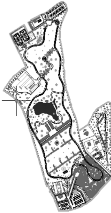
Figure 4. A sketch of Plan 3 (Elaborated by Marrocu, cit. in footnote 6)