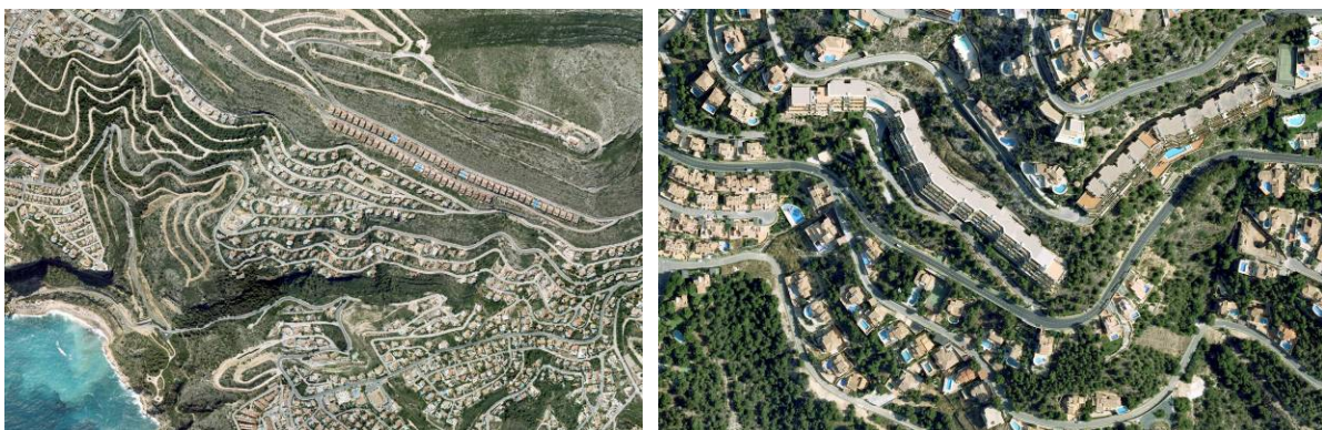
Figure 3. New linear types of buildings near Altea

Regarding the discontinuous urban fabric, there has been a major increase in land used for new low-density housing developments, some of which have had a considerable impact on the land. In the first of these, in Altea, housing developments in the foothills of the Sierra de Bernia have had a particularly surprising visual impact, as not only has an area been used that traditionally formed part of the green system of the hills, the types of buildings erected increase the impact on the landscape: some of these are four-storey multifamily buildings in linear blocks which in some instances are almost three hundred metres long. Taking into account that they are at a certain elevation and that they overlook the basin formed by the estuary of the River Algar, the visual impact stretches for more than ten kilometres.