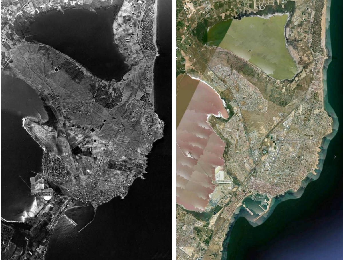
Figure 6. Torrevieja 1984 and 2009.

Regarding town centre growth, Torrevieja has undergone continued urban expansion since the 1970s, characterised by sprawling development within the municipal boundary as a result of the proliferation of low-density developments that are added to with no clearly defined road structure or land designation.