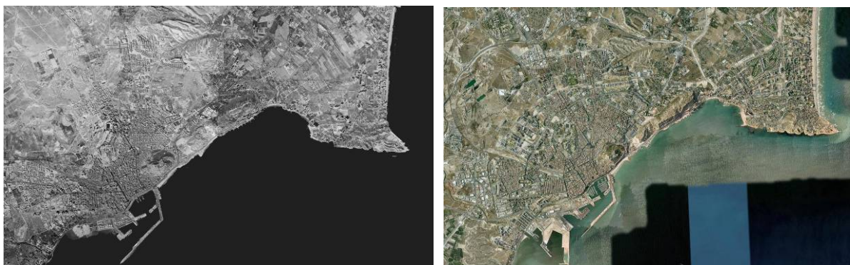
Figure 4. Alicante 1984 and 2009.

The influence of the province's capital, the city of Alicante, is felt most particularly in this area, where land use is closely linked to the coast, in terms both of continuity with previously developed areas and of vacant land. In fact, the coastline from north to south has, with some exceptions, now been fully developed, and the only stretches that remain vacant are the cliff areas and the mouth of the River Seco, to the north of Campello, and the tidal marsh of Agua Amarga, in the south of Alicante.