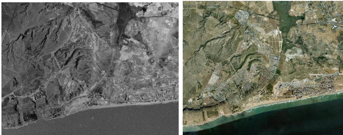
Figure 5. Sierra de Santa Pola 1984 and 2009.

Until recently, this district had been less affected by the characteristic dynamics of tourism experienced by the rest of the province, although this trend has changed in recent years. The administrative configuration of this area has led the municipal area of Elche to include just the northern and southern points on the coast of this district, with the central area occupied by Santa Pola, and it is precisely here where the second largest increase of land used for discontinuous urban fabric has been experienced, with a 634% increase between 1990 and 2006.