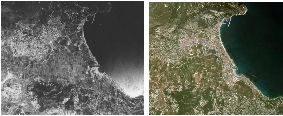
Figure 2. Jávea 1984 and 2009.

the traditional urban centre has become consolidated, together with areas linked to roads connecting the town with outlying areas. In Jávea, the urban centre has spread towards the coast, establishing a new continuous area between the historic part of the town and areas of coastal use, and occupying the town's coastal strip to a width of almost half a kilometre which up to the 1970s had received only low levels of artificialisation. In the case of Calp, the little coastal space that existed prior to the period in question has been saturated, with all land between the urban centre and the Peñón de Ifach being used.