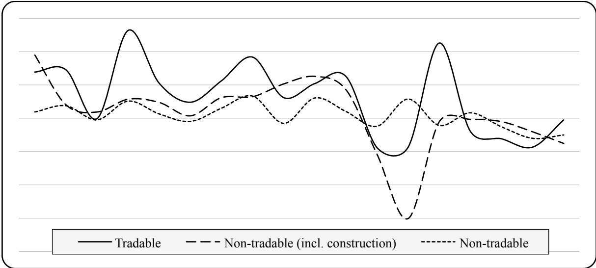
Figure 2: Average productivity growth in the tradable and non-tradable sector for seven countries

Average for all seven countries in the sample (Estonia, Greece, Latvia, Lithuania, Portugal, Slovenia, and the Slovak Republic).