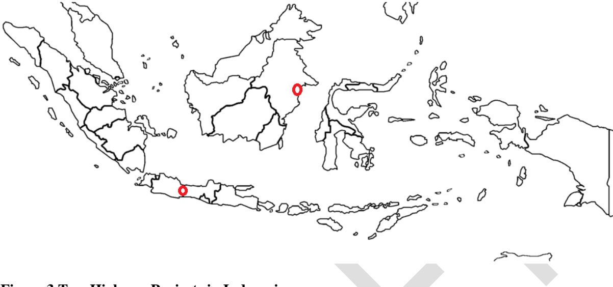
Figure 3 Two Highway Projects in Indonesia