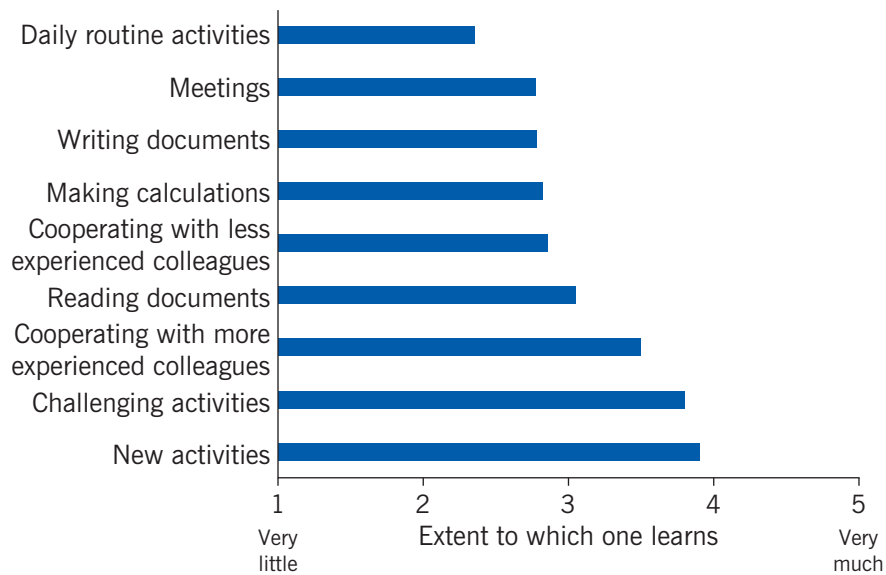
Figure 2. The extent to which workers learn varies by job task, 2013

Source: Borghans, L., D. Fouarge, A. de Grip, and J. Van Thor. Werken en leren in Nederland . Maastricht University ROA-R-2014/3, 2014. Online at: http://roa.sbe.maastrichtuniversity.nl/roanew/wp-content/uploads/2014/05/ROA_R_2014_3.pdf [1].