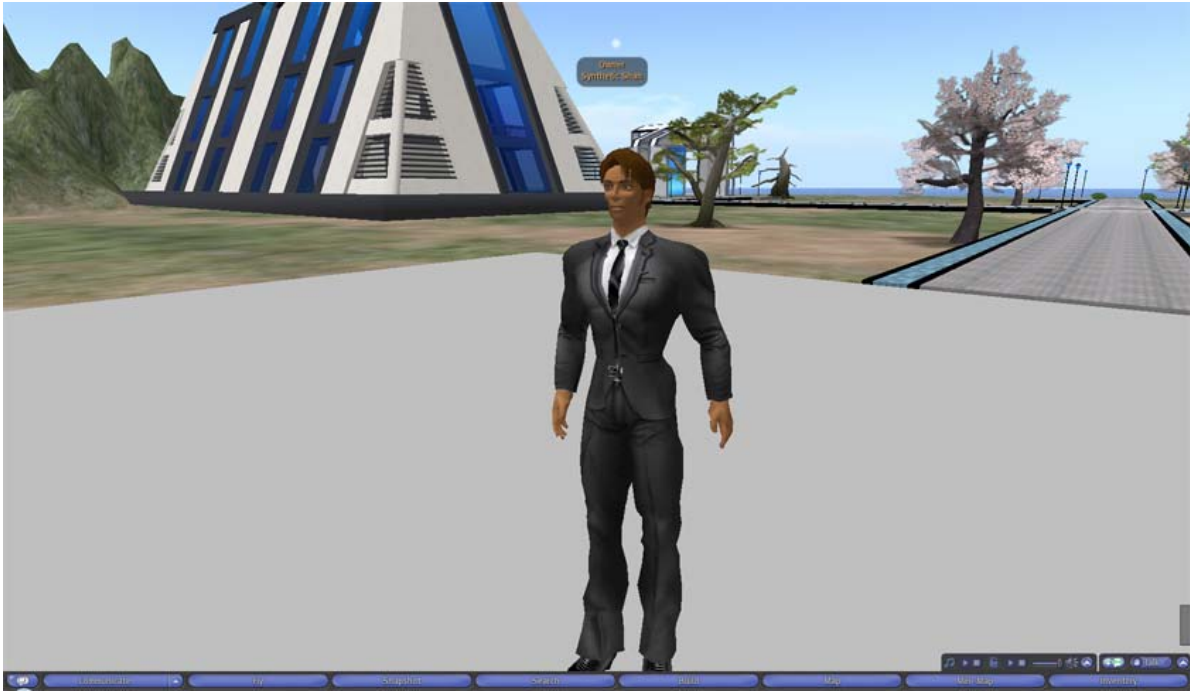
Figure 2. Research Avatar