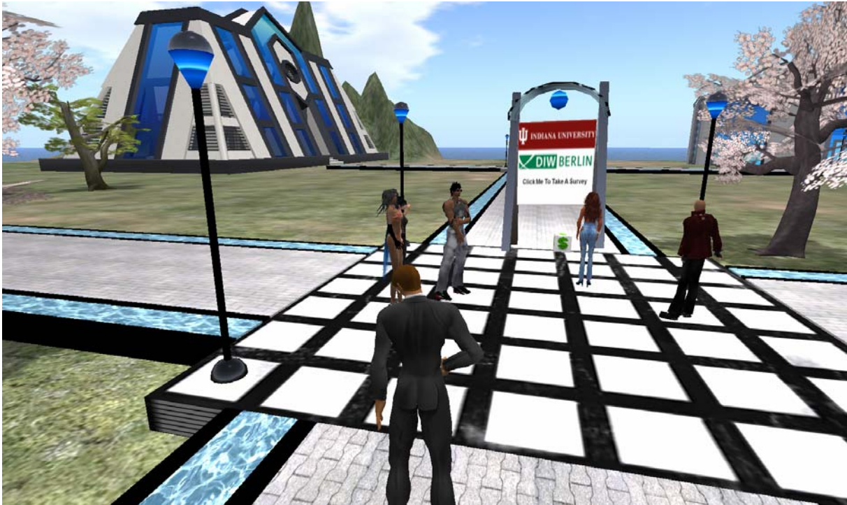
Figure 1. Survey Kiosk