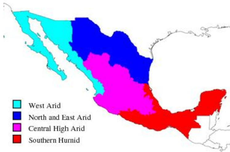
Figure 2: The regional disaggregation adopted for the Mexican SAM