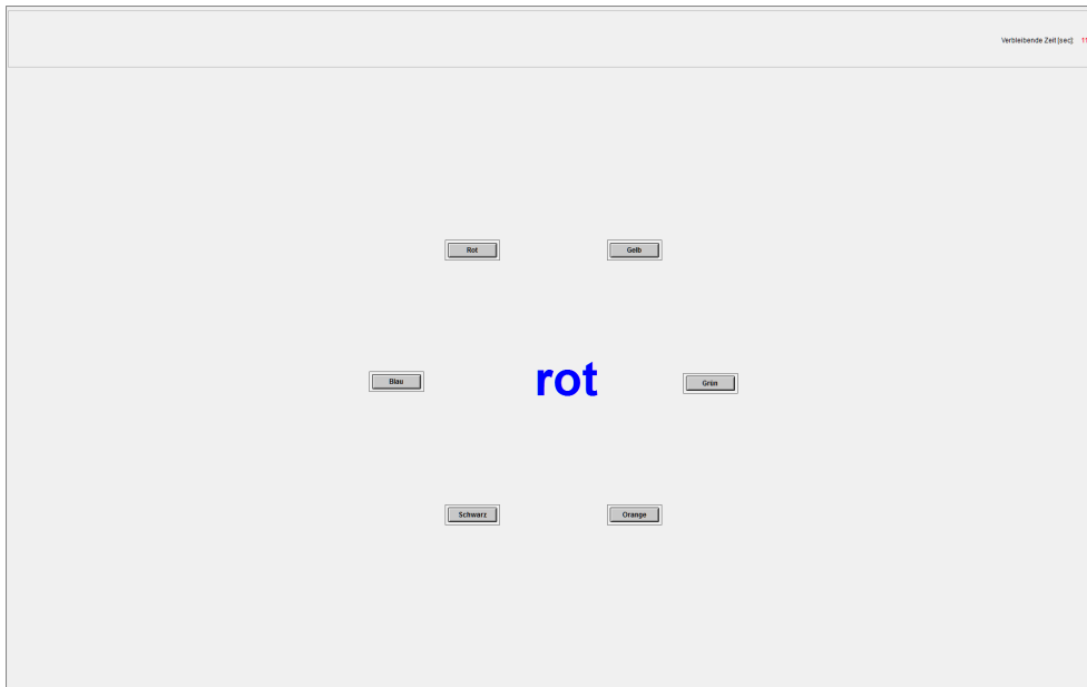
Figure 1. Screenshot of the computerized Stroop (1935) test. The screenshot depicts an incongruent trial, i.e., the meaning of the color word “rot” (“red”) does not correspond to the color of the word (blue). Subjects would have to press the “Blau” (“Blue”) button.

trial and the share of correct answers. We expect longer response times and a lower share of correct answers in the depletion compared to the control treatment.