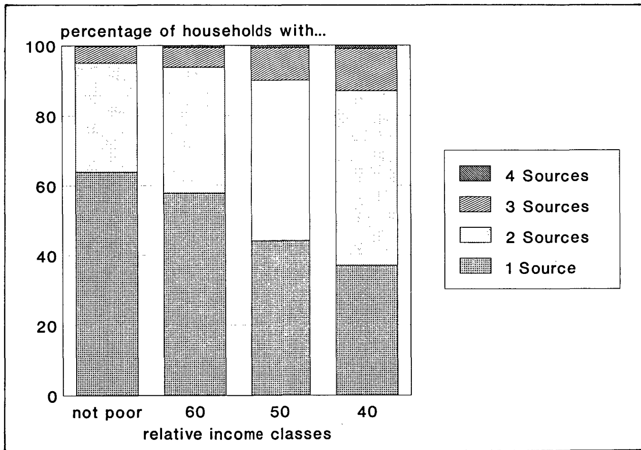
Number of Income Sources

The Bielefeld Data Bank AKD/KDN data contain information on social assistance payments and all other household income sources (Andreß 1992). These data are very reliable, since the main purpose of the AKD/KDN is to check entitlement to social assistance. Because social assistance benefits are paid only after other income sources are exhausted, income and all other assets are examined very thoroughly by the local authorities. The AKD/KDN coding scheme is more differentiated than the GSOEP income questions, but we have tried to reproduce the GSOEP classification of income sources with the Bielefeld data 3 . These income data were then combined with social assistance payments within the data bank. The following analysis excludes all households with missing income information, either because the data are missing or because the household has no other income except social assistance. This exclusion understates social assistance dependency. On the other hand, we have not restricted this sample with respect to age so that pensioner households are included that by definition have very low market incomes. Therefore the following results should be considered as approximations.