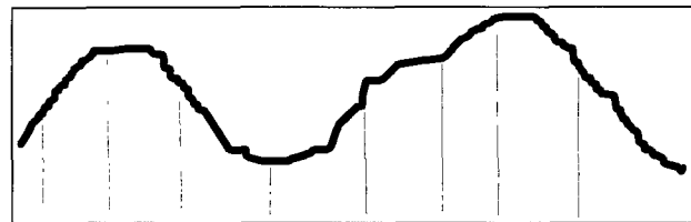
Sampling the Analogue Signal

Each sample is represented by a binary number eg 01100111.