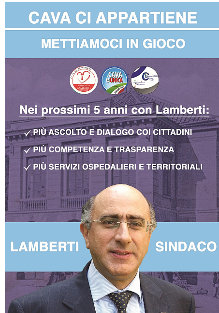
Figure C.4: Flyer with Negative Message, Field Experiment in Cava