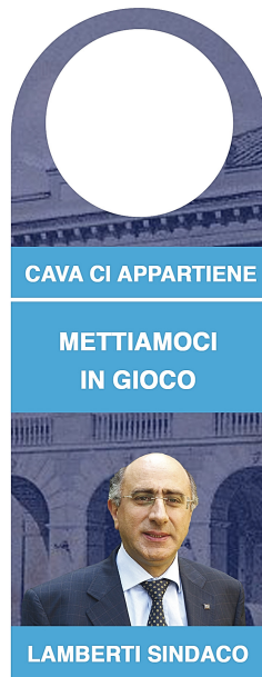
Figure C.6: Hanger with Negative Message, Field Experiment in Cava