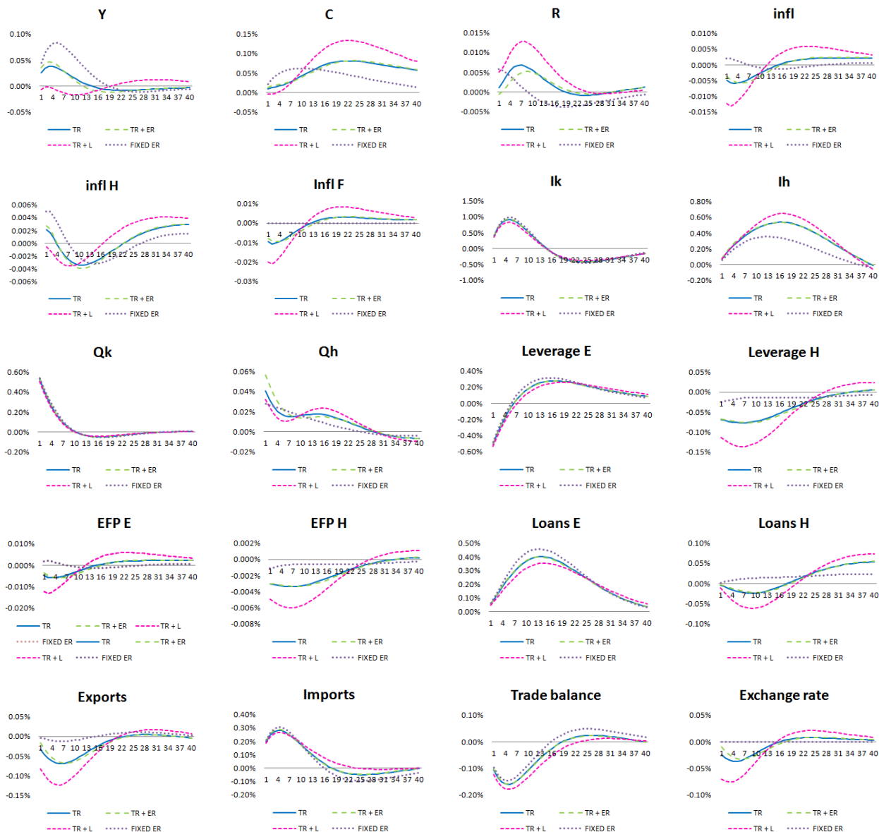
Figure 2: Responses to a one standard deviation capital inflow shock (entrepreneurs), under different Taylor rules

Note: Responses to a one standard deviations technology shock, in percentage deviations from the steady state. The response of the domestic interest rate is in basis points