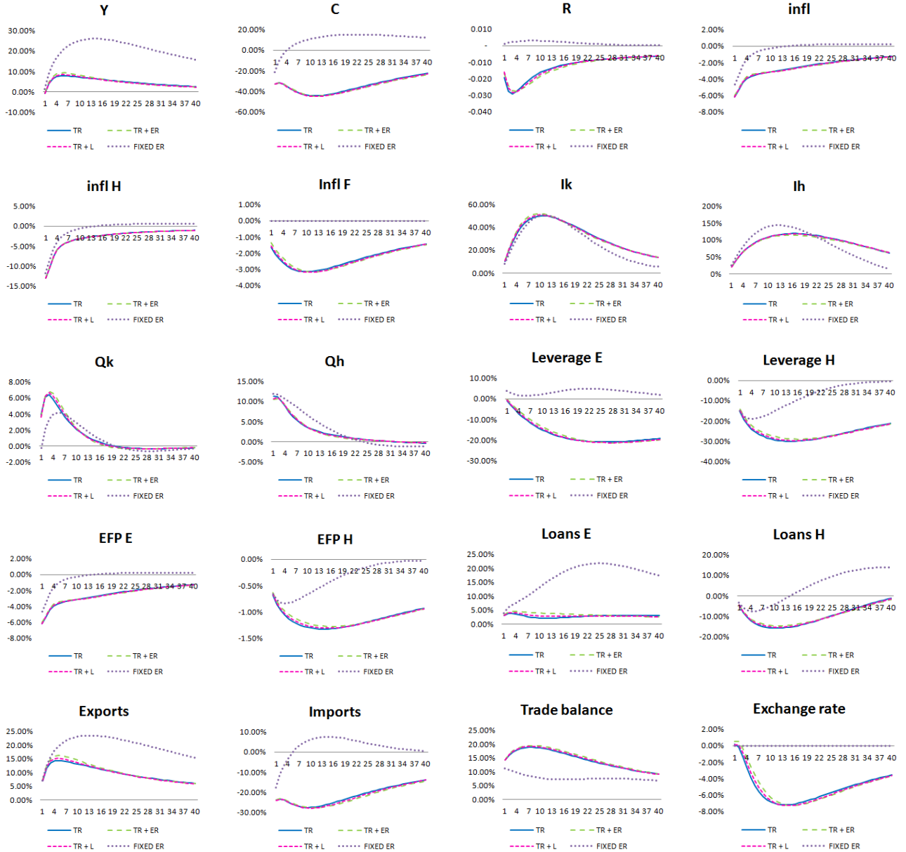
Figure 1: Responses to a domestic technology shock under different Taylor rules

Note: Responses to a one standard deviations technology shock, in percentage deviations from the steady state. The response of the domestic interest rate is in basis points