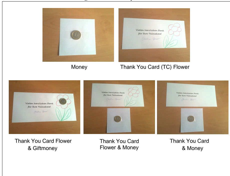
Figure 3: Gifts in Experiment 2

Note: The translation of the text on the card is: "Thank you very much for your participation!"