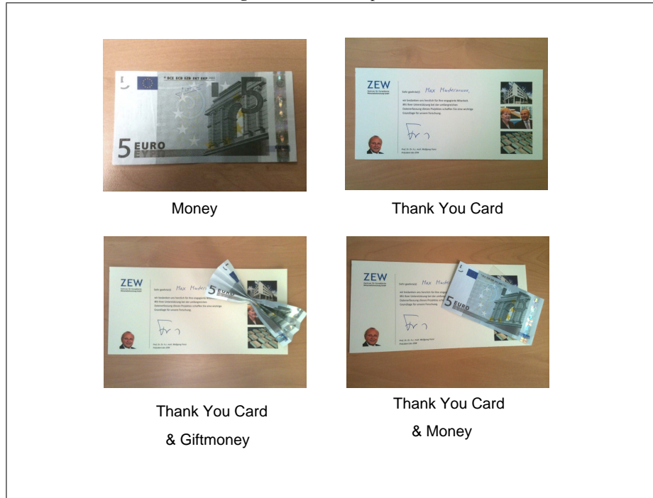
Figure 1: Gifts in Experiment 1

Note: The translation of the text on the card is: "Dear John Smith, we would like to thank you for your efforts. Your work on this project's comprehensive data entry, will create an important foundation for our research."