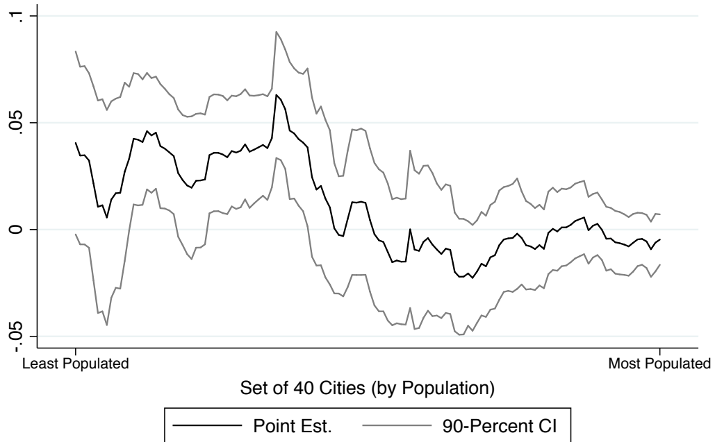
Figure 1: Estimated effect of normalized homicide on concealed-carry applications by city size

Estimates are obtained from using a moving sample size of 40 cities, starting with the 40 least populated cities in the data (far left) and incrementally moving to the 40 most populated cities in the data (far right).