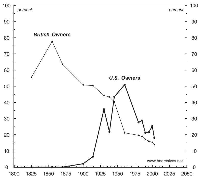
Figure 2 Share of Global Gross Foreign Assets

NOTE: Gross foreign assets consist of cash, loans, bonds and equities owned by non-residents. The last data point is for 2003.