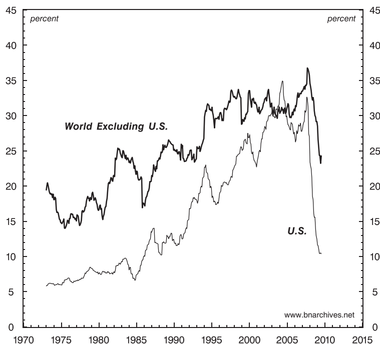
Figure 4 Net Profit Shares of Listed FIRE Corporations (% of Region)

NOTE: Net profit is computed as the ratio of market value to the price-earning ratio. Total and FIRE profit for firms outside the U.S. are calculated as a residual, by subtracting from the world figures the corresponding figures for the U.S. The last data points are for July 31, 2009.