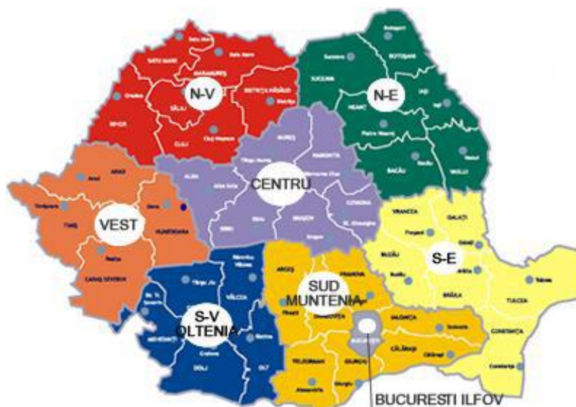
Fig.1- number of agricultural cooperatives in Romania by region