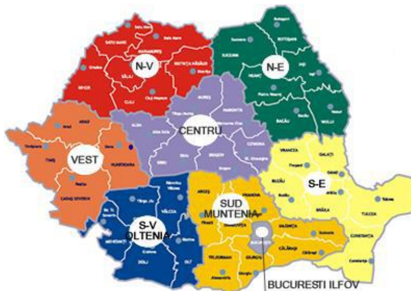
Fig.1- number of agricultural cooperatives in Romania by region