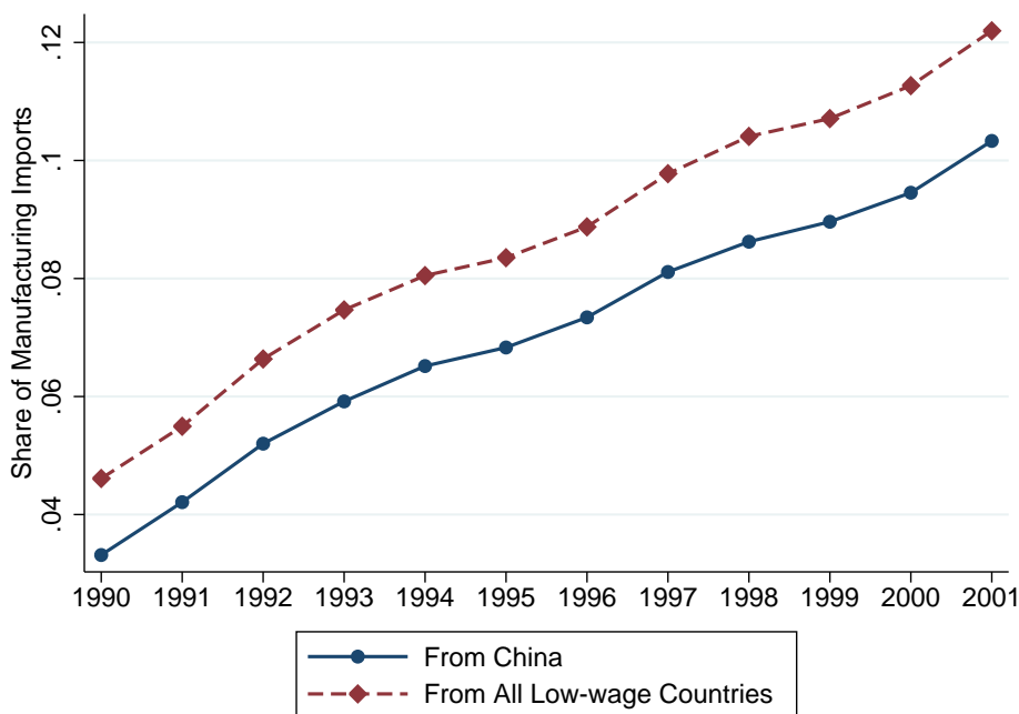
Figure 1: Share of Manufacturing Imports in the US from China and All Low-wage Countries

Innovation is considered a fundamental driving force for economic growth (Romer, 1990; Aghion and Howitt, 1992). While manufacturing firms only account for less than 10% of US private sector employment, they generate more than two-thirds of both research and development (R&D) spending and corporate patents. In recent decades, manufacturing firms in the United States (as well as those located in other advanced economies) have experienced dramatically increasing import competition from low-wage countries. China has led this wave of expansion in international merchandise markets, with an annual increase in manufacturing exports of more than 18% during the past two decades. Figure 1 shows that the rising share of manufacturing imports into the US from low-wage countries increased from 4.6% in 1990 to 12.2% in 2001, thanks to a substantial contribution by products made in China. 1 Note that China has been the major contributor behind this surge in imports. As this trend has continued in more recent years, it is important to understand its impact on innovative activities of US firms.