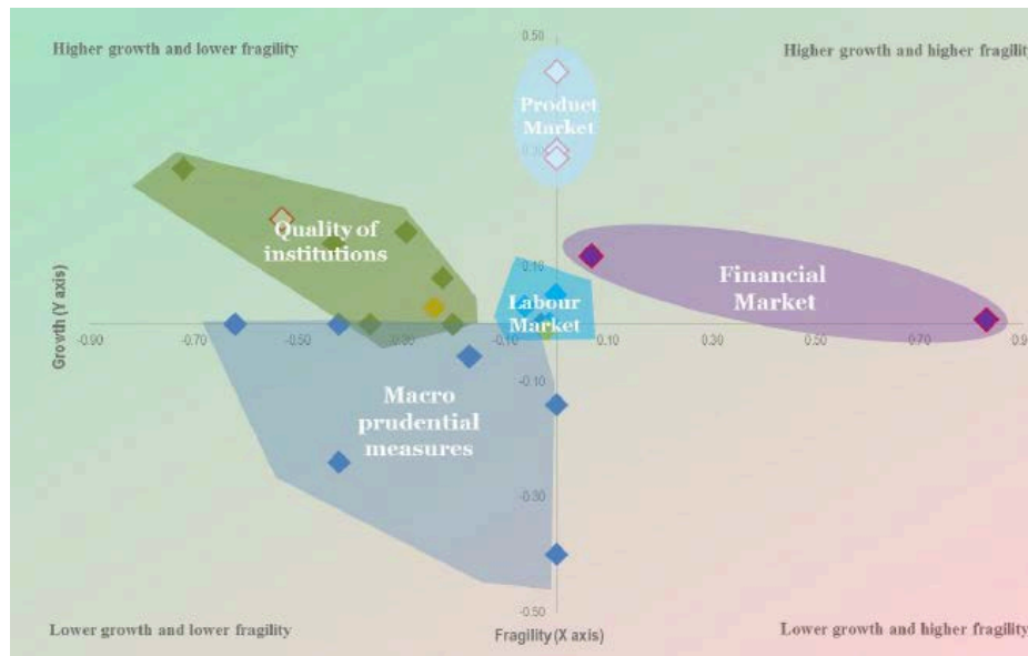
Figure 1: Policy areas in a growth-fragility framework

Note: Structural policies should be assessed on the basis of their effect on growth and economic fragility. In this chart, the effect of policies on economic fragility is plotted on the horizontal axis, the effect on growth is shown on the vertical axis. Fragility is defined as a higher likelihood of financial crises (banking, currency, or twin crisis) or a higher GDP (negative) tail risk. Different risk-growth patterns emerge for each policy area considered—pro-growth labour and product market policies improve economic performance without substantially affecting economic fragility. Better quality of institutions both increases growth and reduces economic fragility. However, macroprudential and financial market policies entail a growth-risk trade-off—the former decrease economic risk to the detriment of a higher growth rate, the latter promote growth but also increase financial risk.