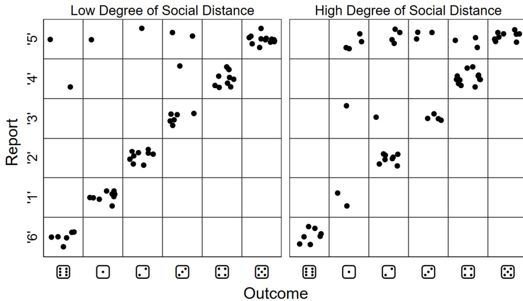
Figure 1: Outcomes and reports.

Regardless of the outcome, a report of ‘1’ earned the participant €2, a report of ‘2’ earned €4, and so forth. A report of ‘6,’ however, resulted in zero payoff.