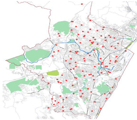
Fig. 1. Spatial distribution of schools in Recife.