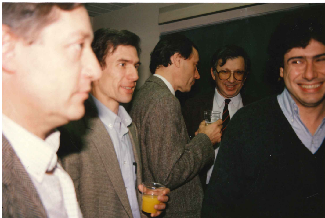
Photograph 7: Grandmont, J.P. Benassy, A. Monfort, G. Laroque, and Ph. Aghion, Paris, 1989.