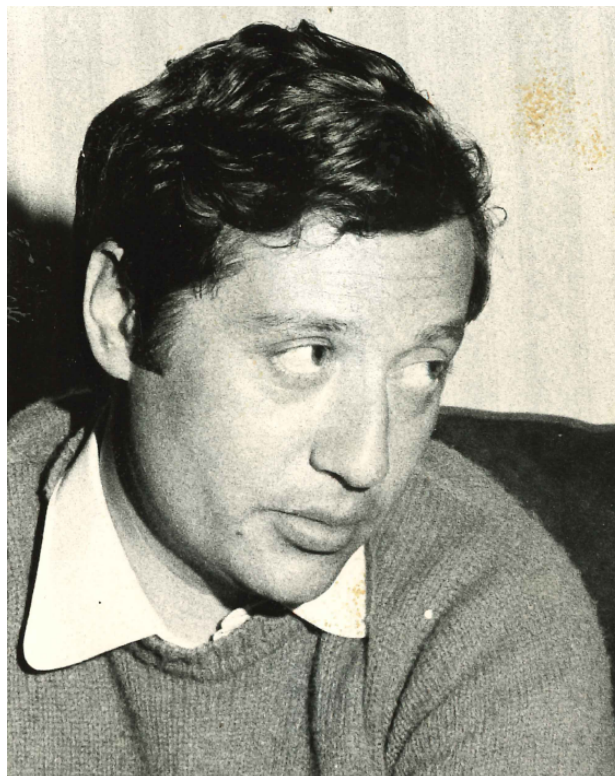
Photograph 6: Grandmont, Paris, circa 1980.

were bound to get some traction, and the stagflation of the 1970s certainly helped that attack, even if it was less relevant than claimed. Animus against government activism also played a key role, both in motivating the new classical economists themselves and in guaranteeing them external support.