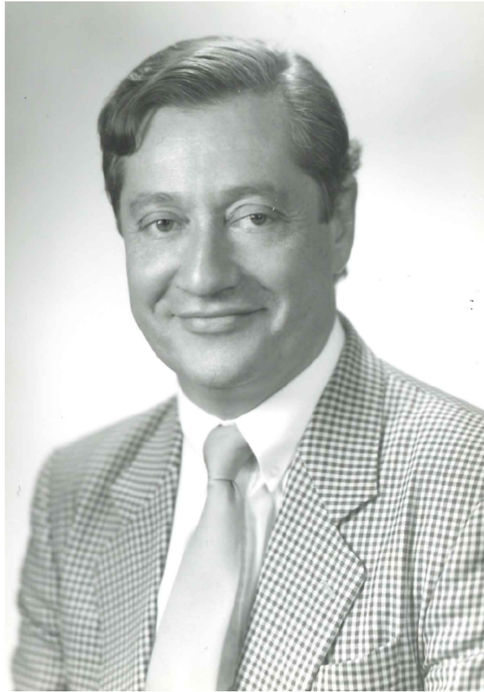
Photograph 9: Grandmont's photograph for Econometrica front page, Paris, 1991.

writes: “The idea that expectations of the agents of a socioeconomic system can influence the observed trajectories of that system, and in particular generate multiple equilibria (stationary, with a steady growth, or fluctuating over time), through a mechanism of self-fulfilling prophecies, has a long history in the social sciences” and warns that public intervention should (in the presence of multiple equilibria) “tend to coordinate the agents’ expectations through appropriate policy rules that are clearly announced and understood by the public.” Grandmont, Pintus, and De Vilder (1998) develops a simple geometric characterization of sunspot equilibria (stochastic endogenous fluctuations), in terms of the invariance properties of their supports in the underlying deterministic dynamics.