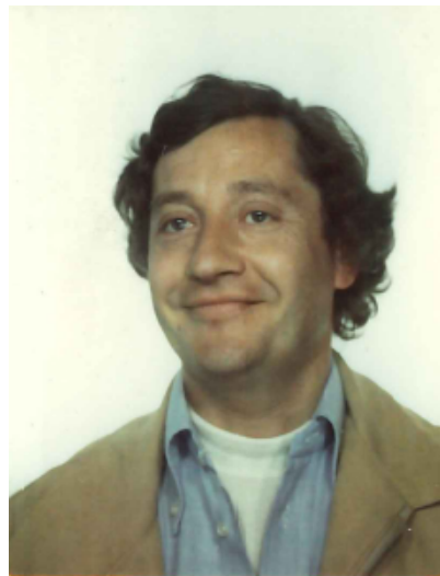
Photograph 3: Grandmont, Paris, mid 1970s.

In his 1978 paper, Grandmont establishes a major result in the theory of voting: under which circumstances can individual preferences be aggregated through the majority rule? Or mathematically stated: Is the majority rule transitive? To understand the context of this article it is useful to quote Tullock: