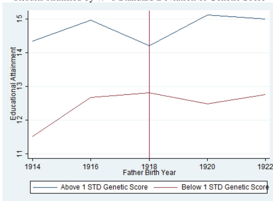
Figure 2 Effects of Paternal In Utero Influenza Exposure on Child's Educational Attainment Results stratified by +/- 1 Standard Deviation of Genetic Score

Notes: Birth Year Collapsed into two-year cells. Plots show unadjusted means.