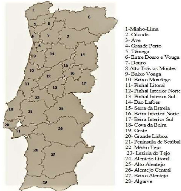
Fig.1 Portuguese NUTs III regions (Mainland)

The location quotients for 2008 are shown in Table 1. The region of Lisbon has the highest incidence of higher scores; followed by Baixo Mondego, Porto and Setúbal, and this incidence is higher than the national average.