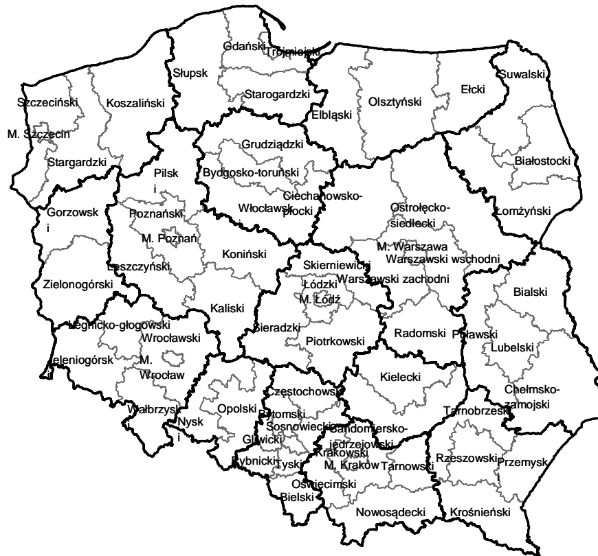
Figure 1. The 16 Polish NUTS 2 regions (dark bold line) divided into 66 NUTS 3 regions (grey line)