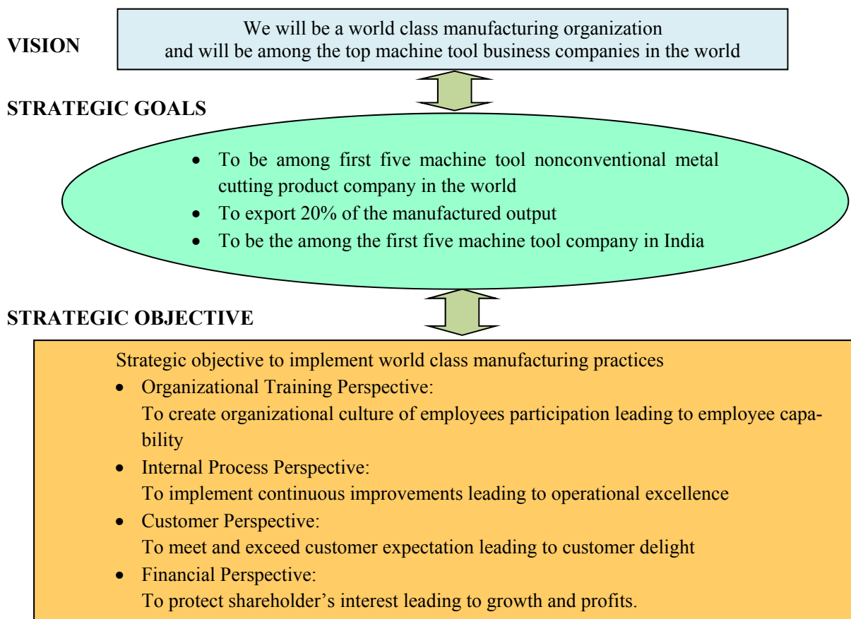
Figure 2. Vision and strategy for the machine tool organization "X"

For our organization, which was into the machine tool industry, we formulated the vision, framed the strategic goals, and defined the strategic objectives as shown in Fig. 2.