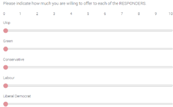
Figure 6.1: Slider task to determine the proposer's offers for a responder of different political identities.

outcomes from it based on the choices you make. The game that is randomly selected will be paired with another randomly selected participant in the study who is playing the opposite role to you. If you are a PROPOSER your match will be a RESPONDER. If you are a RESPONDER your match will be a PROPOSER. Payment details will be given at the end of the survey.