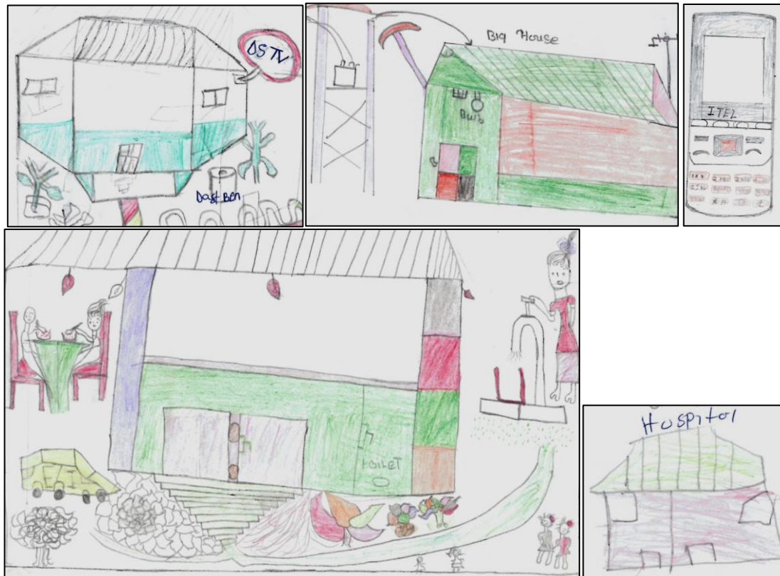
Figures 7-11: City Life from Harrson (16), Raimond (15), Mysterious (17), Margret (16), Vincent (15)

In this context, a considerable number of the respondents had rather naïve perceptions about life in urban areas and romanticised some of its features. For example, there was a strong and common perception that people do not have to work in towns but can still enjoy the amenities of urban areas as reflected by the following quotes: