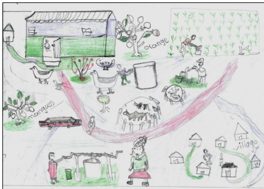
Figure 1: “Future Farm” by Taomga (15)

Interestingly, most of the students participating in the drawing exercises had a clear understanding of how they aimed to attain their future farm . In most cases, this pathway started with the diversification of farm production during the first years. This included growing additional cash crops besides maize (such as sunflowers and cotton) and at a later stage also vegetables and fruits. After some years, they would buy some animals (first small animals such as chickens; then larger animals such as goats and later also cows) and equipment for using animal draught power for land preparation, weeding and transportation. The time component of aspiration and the pathways to the future farm can best be illustrated not by statements but by drawings (see Figures 2 and 3).