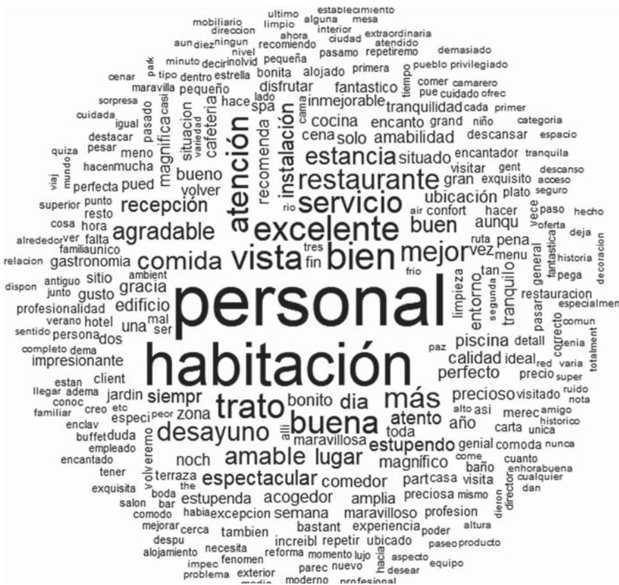
Figure 2. Word cloud showing most frequently used words