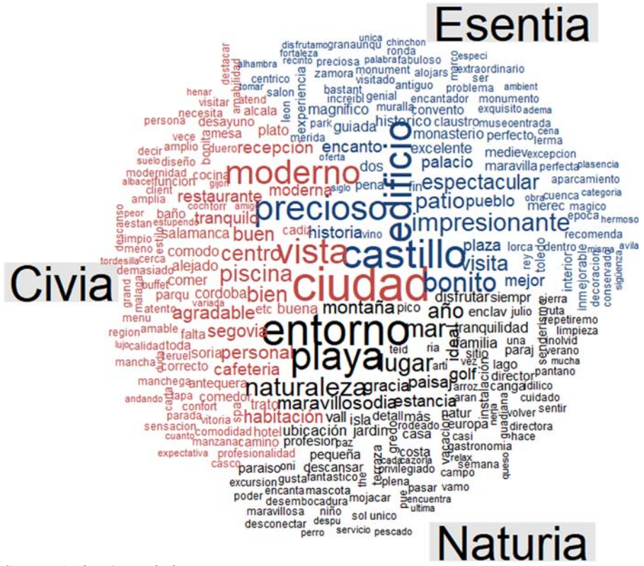
Figure 3. Comparison word cloud