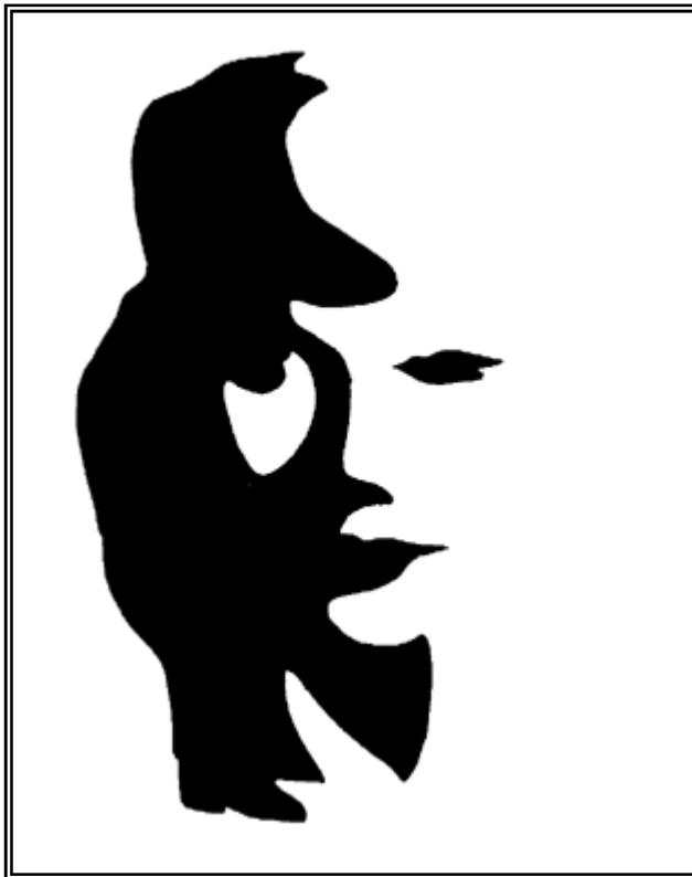
Figure 2: Is it Bill (playing the sax) ... or Hilary?

Customer service technologies embody just such taxonomies and models. Customer Relationship Management systems which are precisely designed to focus the organisation’s attention on the (external) customer, similarly require the organisation to first focus on the (internal) model of the customer. And this model is, to a very large extent, one that is built into the systems which support Customer Focus. These technologies increasingly form the ‘lens’ through which public services focus on their users.