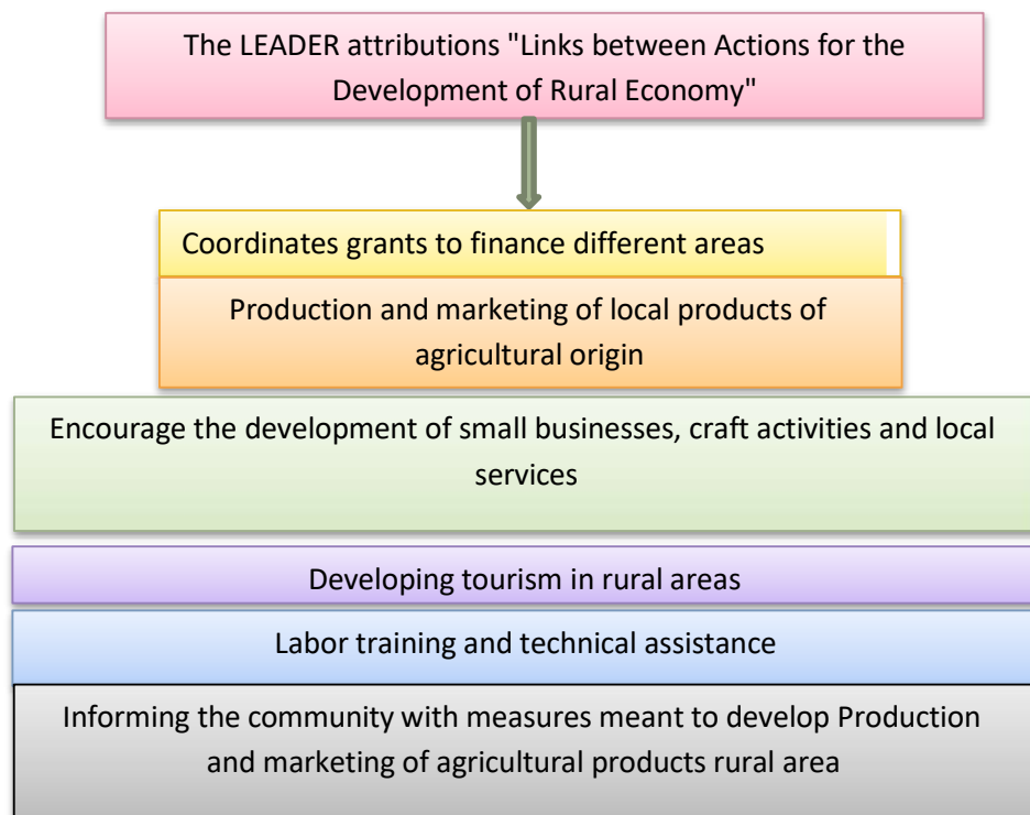
Fig.1 The LEADER Initiative "Links between Actions for Rural Development"