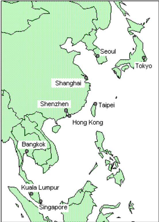
Figure 2: Financial Places in Asia

A growing source of uncertainty in recent years has become mainland China's increasing presence in Hong Kong's banking sector raising fears of spillover of financial instability. But, mainland China is still felt in another respect, namely the growing competition from Shanghai