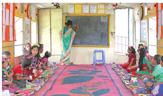
Fig. 2 A class setting environment at BRAC boat school.