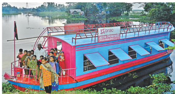
Fig. 1 An exterior design of BRAC boat school.

remote areas. High impact and low cost BRAC boat schools were inaugurated in October 22, 2012 as a result of a partnership between EAC (Educate A Child) and BRAC to promote quality primary education for unprivileged children of Bangladesh (The Daily Star 2012). It is a remarkable, innovative step to bring about “ Shikha Tari ” operated (as shown in Figs. 1 and 2) under the BRAC education program. Initially, over 13,000 out of school children were targeted to allow them a second chance of coming back to school by launching 452 boat schools across 14 districts of Bangladesh (BRAC 2016).