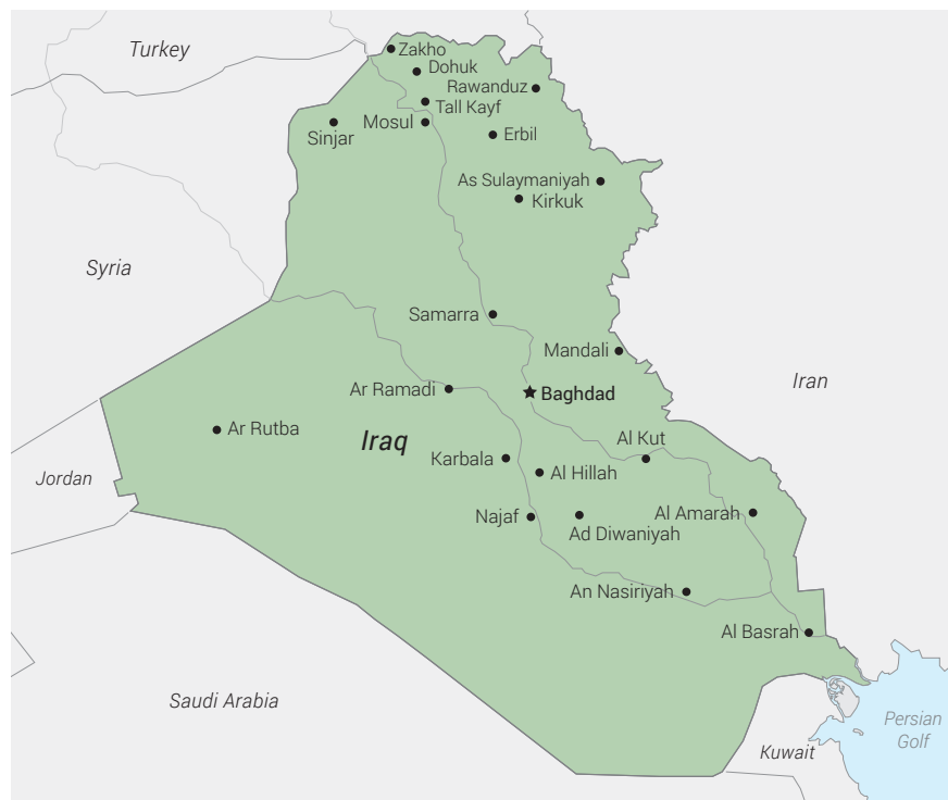
Figure 1: Map of Iraq

The final section of the paper takes a closer look at a key element related to reconstruction, namely the return of Iraq's Internally Displaced People (IDPs). The Iraqi state's current weakness is underlined by the slow pace of reconstruction, despite concerted pressure to see IDPs return and life in the areas most affected by IS to be normalized. A key obstacle in both respects is the fragmentation of security. This study draws on two weeks of fieldwork in Baghdad and Erbil in October 2018, as well as research trips to Mosul, Erbil, Sulaymaniyah and Baghdad in 2017 and 2018. During these research trips interviews were conducted with key Iraqi stakeholders, mainly at the political level, as well as representatives of international organizations working in Iraq. It also draws on documents collected during field visits and interviews, as well as secondary material. The report provides a limited glimpse into some of the challenges that currently face Iraq, but nevertheless provides an informed analysis of aspects of the complex political dynamics that are currently shaping Iraq's future.