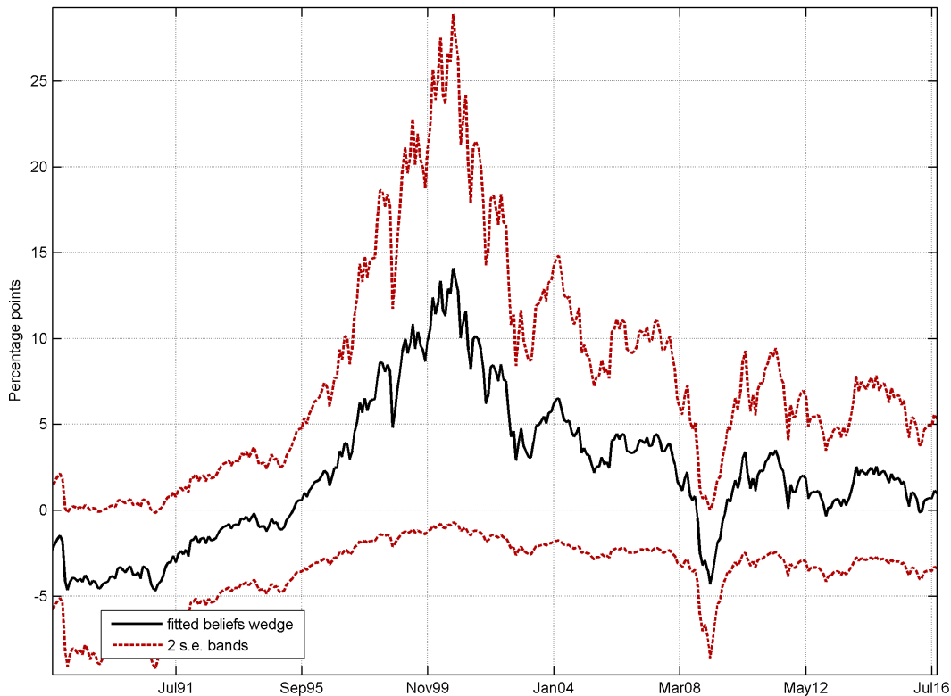
Figure 2: Fitted values from regression (18) of subjective expected returns in excess of the estimated objective expected returns on the P/D ratio in the UBS extended sample. The objective expected returns are estimated from regression (13) of realized returns on P/D ratio over a longer sample from 1926 to 2017.

optimistic. Following crashes, like in early 2009, investors are too pessimistic. The UBS/Gallup survey includes observations from the late 1990s, but no observations from the financial crisis and its aftermath. In contrast, the Shiller surveys include observations from the financial crisis and subsequent years. This partly explains why these other surveys on average have a lower share of optimistic observations than the UBS/Gallup survey.