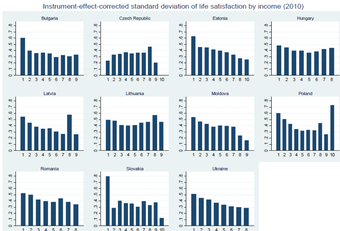
Figure 2 - Life satisfaction inequality by income (2010)