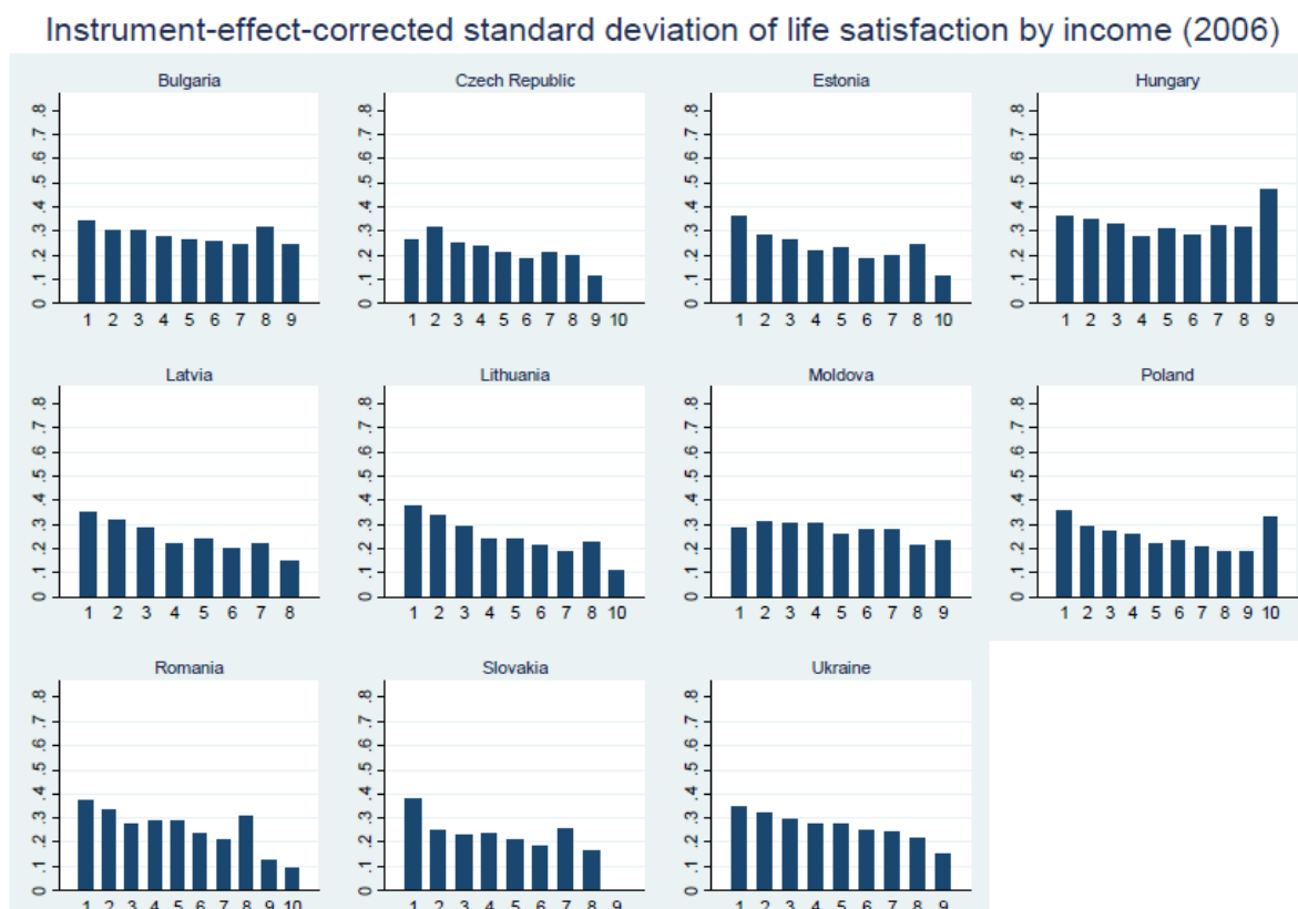
Figure 1 - Life satisfaction inequality by income (2006)

Source: own computation. Data from Life in Transition Survey, 2010.