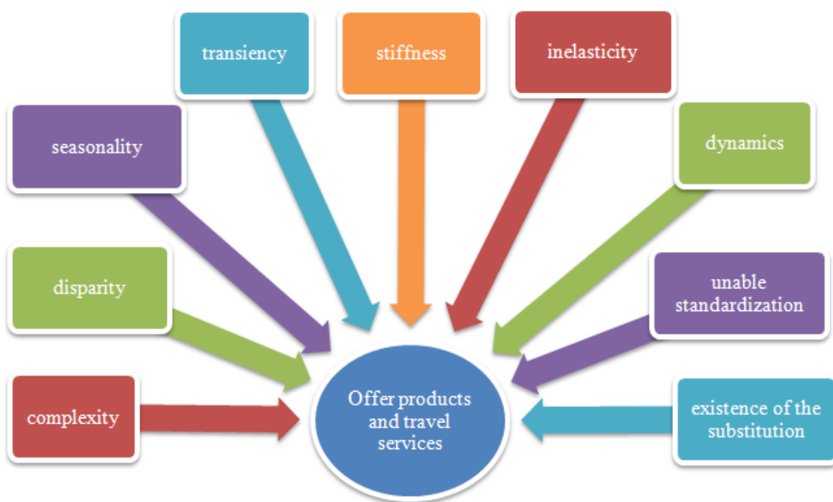
Figure 1 – Characteristics of supply of tourism products and services