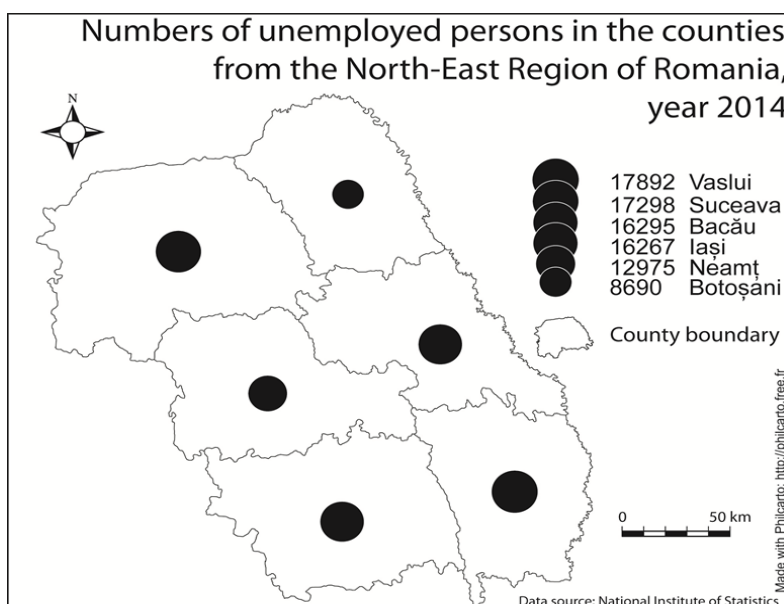
Figure 2 - Numbers of unemployed persons in the counties from the North-East Region 2014

Although the link between migration and economic development receives special attention, the particular dynamics of migration and its effects on the labor markets of sending countries are still poorly understood due to the lack of reliable data. OECD studies on this subject concluded that migration has little or no impact on employment: a 1% increase in the number of immigrants reduces employment for low skilled workers by 0.04% and reduces employment on average by a ‘negligible’ 0.02% (Vasilescu et al. , 2012).