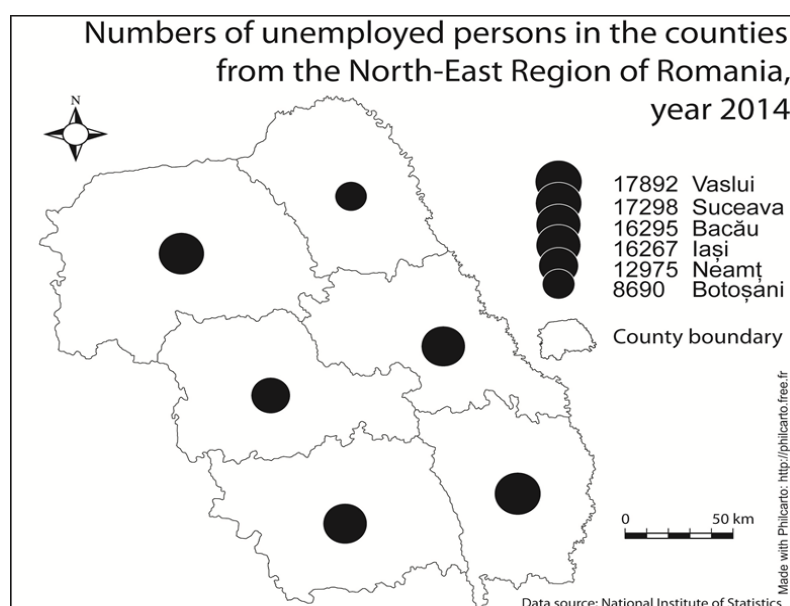
Figure 2 - Numbers of unemployed persons in the counties from the North-East Region 2014

Although the link between migration and economic development receives special attention, the particular dynamics of migration and its effects on the labor markets of sending countries are still poorly understood due to the lack of reliable data. OECD studies on this subject concluded that migration has little or no impact on employment: a 1% increase in the number of immigrants reduces employment for low skilled workers by 0.04% and reduces employment on average by a ‘negligible’ 0.02% (Vasilescu et al. , 2012).