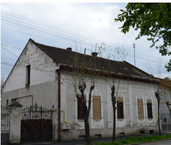
Figure 5 - House on Hasdeu street

For a short case-study a parallel presentation of two types of houses is desired, both of them valuable, one being from the historical and compositional point of view, and the other mostly from a historical point of view. Residential houses are the most common Jewish buildings, which have been built in the city of Satu Mare, this is why it is a lot easier for a parallel to be drawn between different types of buildings from this category.