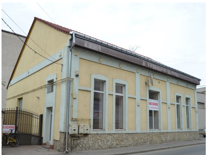
Figure 6 - House on Brancoveanu street