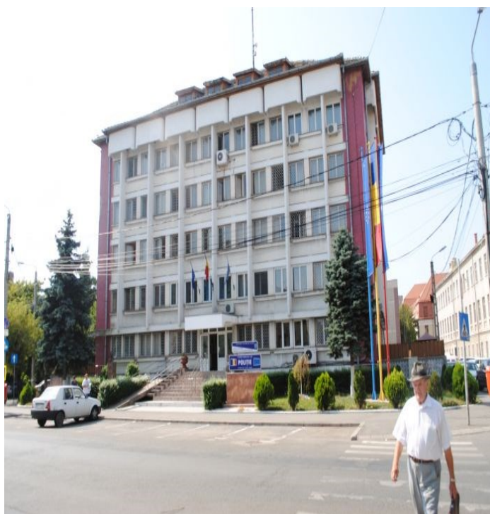
Figure 2 - Building of the Police in the place of Satu Mare