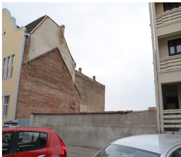
Figure 4 - Place of demolished house on Petőfi street