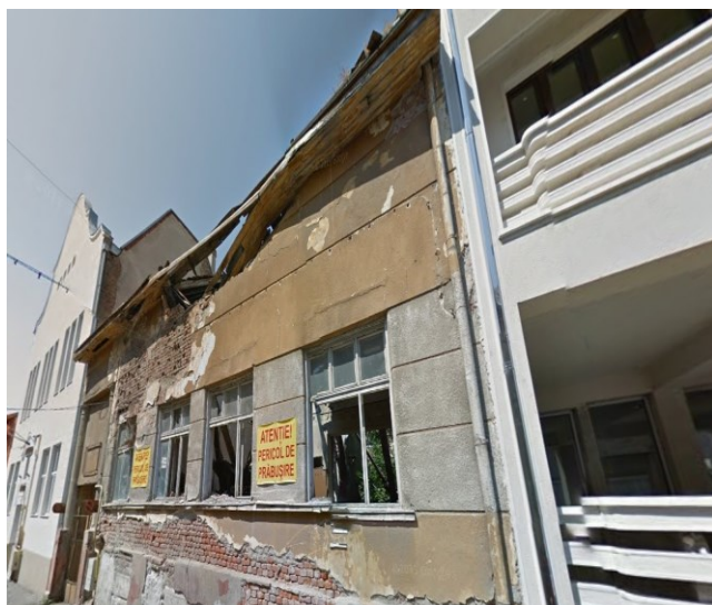
Figure 3 - House on Petőfi street