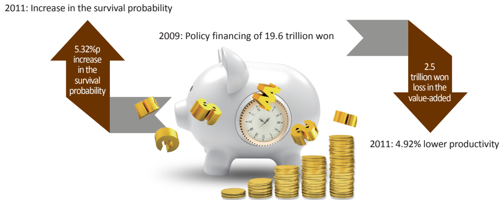
[Figure 2] Economic Effects of Public Funding for SMEs in 2009 (Mining and Manufacturing Companies with Ten or More Employees)